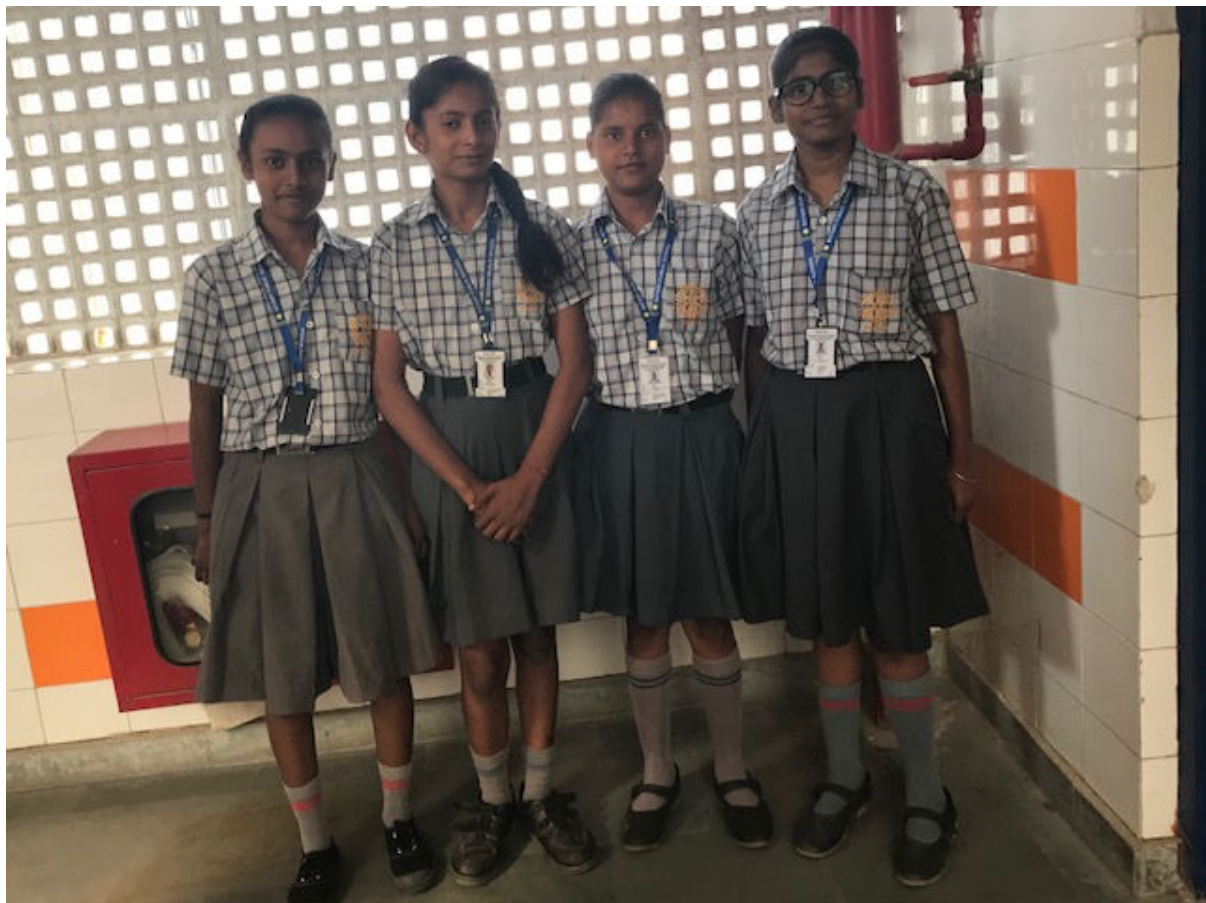
Students at Rotaryschool.

Girls can make a difference if they get the chance to go to school.